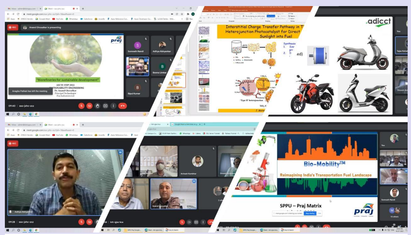
Various activities conducted from March to June. All the activities were conducted in online mode due to lockdown. This includes First on-line mentoring session, On-line IPR workshop, On-line strategic discussion, On-line session for mental health etc.

DST-TEC-SPPU Newsletter Year(2) Vol(1) Jan-20 to June-20